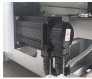
Precise Servo Motor