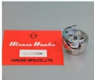
Japan Rotary Hook