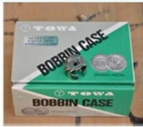
Japan Bobbin Case