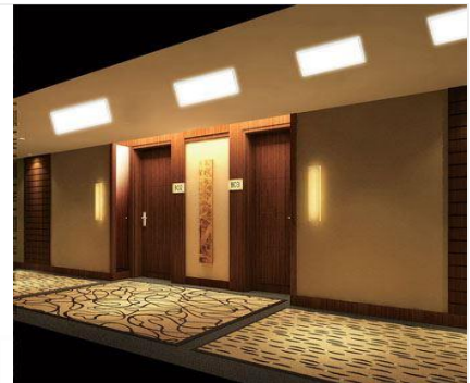
Indoor lighting panel