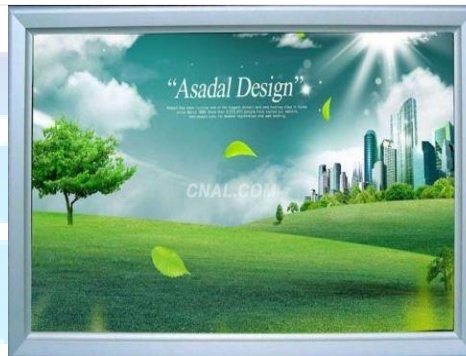
Outdoor advertising lighting box