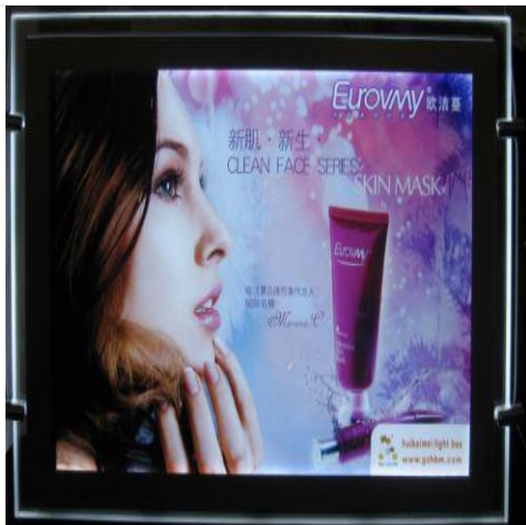
Outdoor advertising lighting box