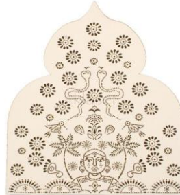
Cut holes and design on paper