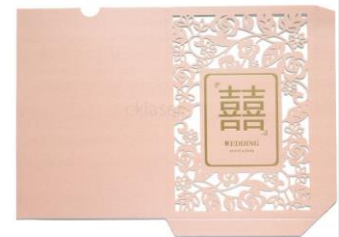
Cutting on Wedding card