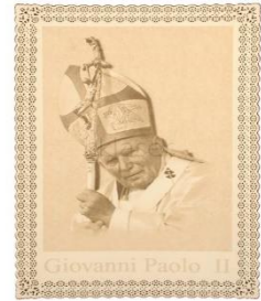
Cutting design on paperboard