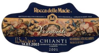
Cut printed label of packing box