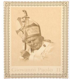
Cutting design on paperboard