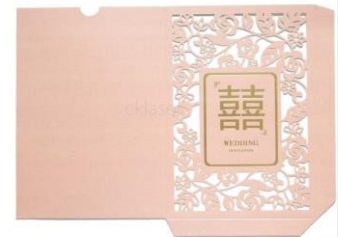
Cutting on Wedding card