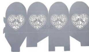
Cut design on paperboard